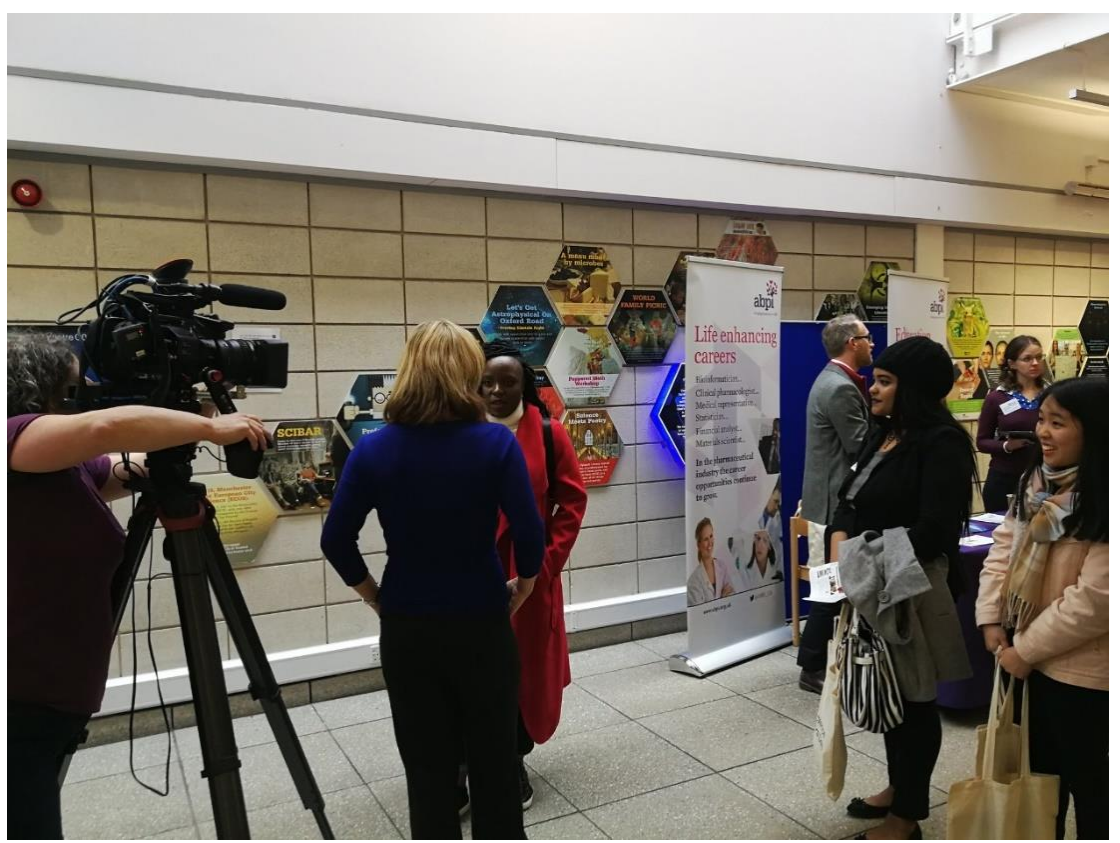
Figure 1: School of Applied Science students interviewed by ITN at the RSB Bioscience Careers Day 2018 (Manchester).