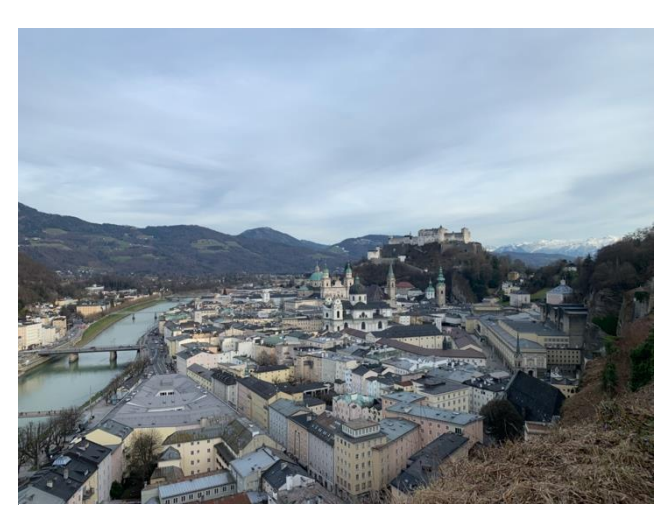
Views over Salzburg.

On the final day of the conference, I presented a poster about my recent PhD work, discussing a method to quantify diffuse cardiac fibrosis using microCT. Presenting my work allowed me to gather feedback and advice from other researchers.