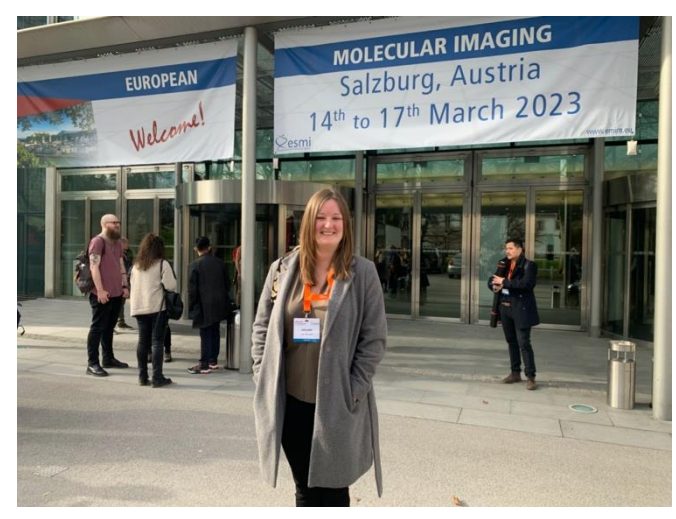
Outside the European Molecular Imaging Meeting conference venue in Salzburg, Austria.

Set in the beautiful mountainous backdrop of Salzburg, Austria, the 18th European Molecular Imaging Meeting hosted over 800 scientists. Covering a wide range of imaging modalities including MRI, PET/CT, and ultrasound, the conference provided many opportunities to broaden my understanding of imaging techniques. It was a pleasure to attend the European Molecular Imaging Meeting with the support of The Royal Society of Biology Travel Grant.